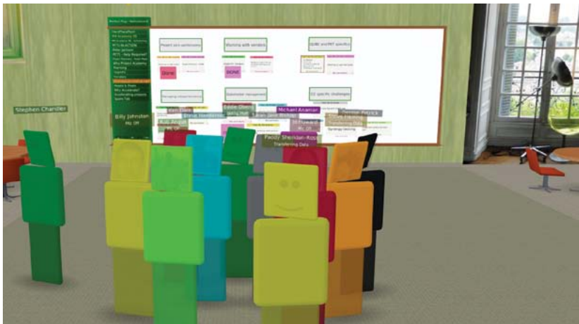
Breakouts Working together at Whiteboard

We call it Learn+DoWare . If you want to be part of the movement or ahead of the game you can join one of our courses to learn how to teach, coach and facilitate workshops on QUBE .